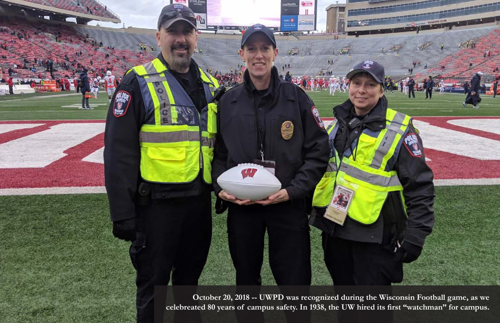
October 20, 2018 -- UWPD was recognized during the Wisconsin Football game, as we celebrated 80 years of campus safety. In 1938, the UW hired its first "watchman" for campus.