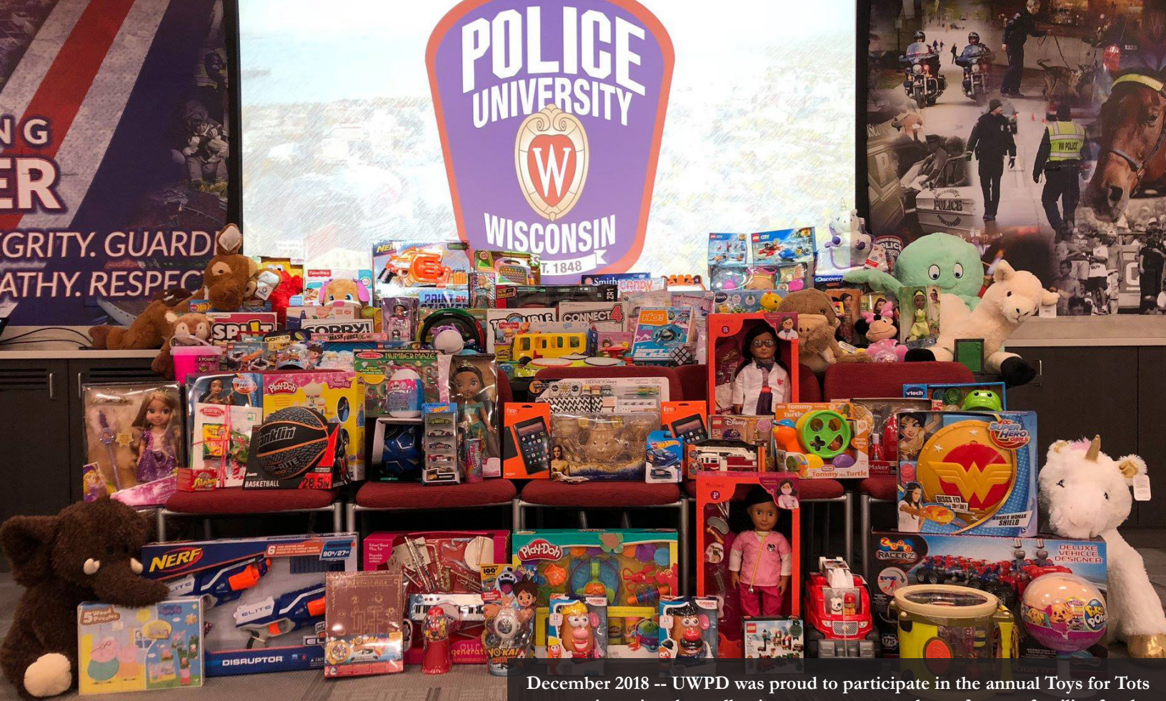
December 2018 -- UWPD was proud to participate in the annual Toys for Tots campaign, aimed at collecting new, unwrapped toys for area families for the holidays. We collected dozens of toys for the campaign!